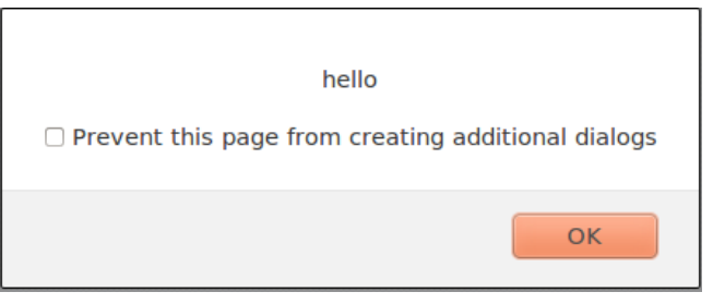
Figure 4. JavaScript alert window in Firefox.

While displaying JavaScript alert windows is little more than an annoyance, serious attacks can be launched through XSS