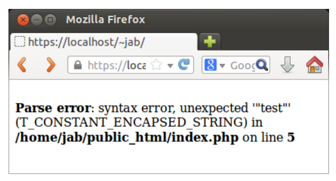
Figure 3. PHP error page.

PHP's configuration file includes the "display_errors" option which can be used to configure whether or not error messages should be displayed [16]. Ubuntu's PHP configuration disables the display of errors messages by default; developers may need to